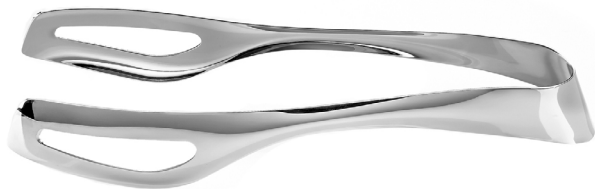
BREAD AND PASTRY TONGS 210MM - GRM 880076