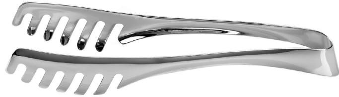
SPAGHETTI & NOODLE TONGS 260MM - GRM880082