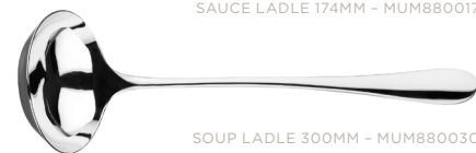
SOUP LADLE 300MM - MUM880030