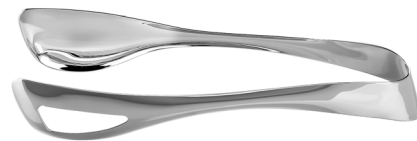
SLICED MEAT & CHEESE TONGS 170MM - GRM880074