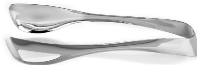
WOK AND CHAFING DISH TONGS 260MM - GRM880081