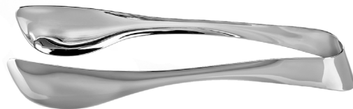
SALAD AND VEGETABLE TONGS 210MM - GRM 880078