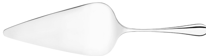
PIE SERVER 248MM - MUM880016