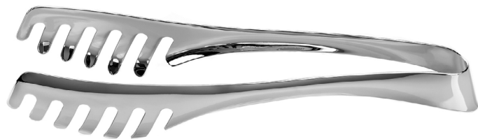
SPAGHETTI & NOODLE TONGS 260MM - GRM880082