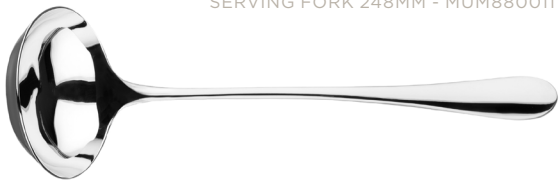
SOUP LADLE 300MM - MUM880030