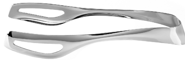
BREAD AND PASTRY TONGS 210MM - GRM 880076